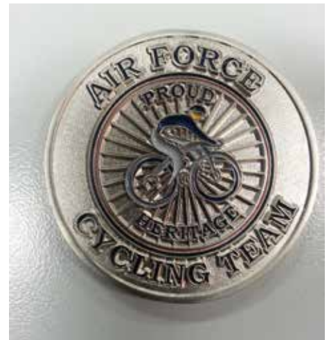
LEFT – Air Force Cycling Team members support each other while riding in the 2015 RAGBRAI. ABOVE – The Air Force Cycling Team coin.