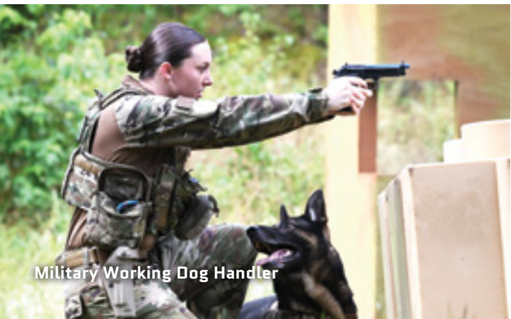
Military Working Dog Handler