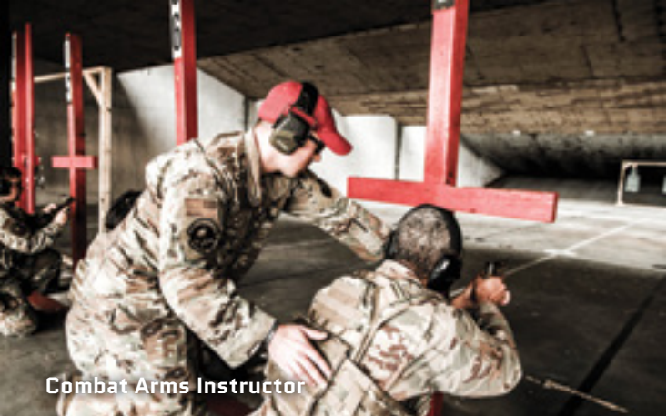
Combat Arms Instructor