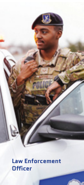
Law Enforcement Officer